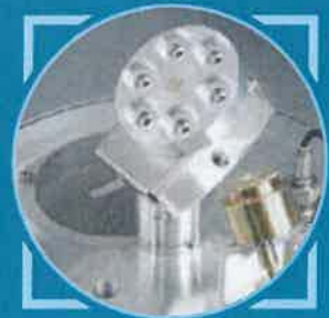
Rotarota planetary stage