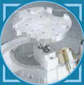
Microscope slide stage